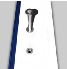
Photo: Element with blind rivet nuts for fastening the rosette

The recess on the rear level with the anchoring holes makes the blaugelb Sliding Rosette PZ oval BNM also suitable for elements that use blind rivet nuts with an edge for fastening. This ensures 100% flush mounting.